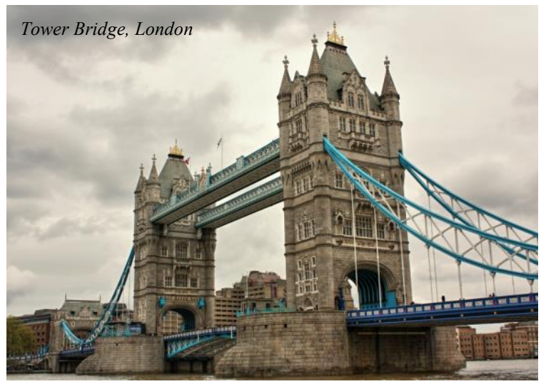
Tower Bridge, London