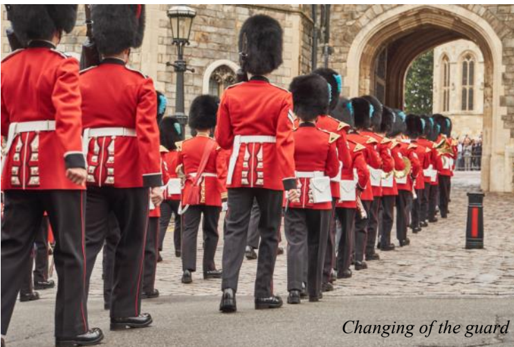
Changing of the guard

Abbreviations for Meals B=Breakfast, L=Lunch D=Dinner