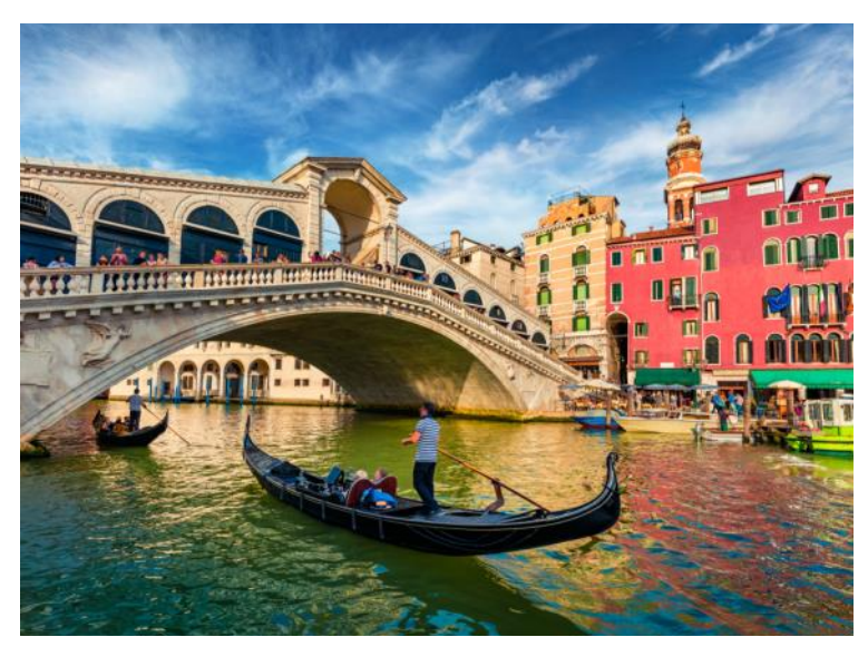
Day 1: Tues, October 8, 2024 • Departure Our tour begins today with our departure to Venice, Italy.