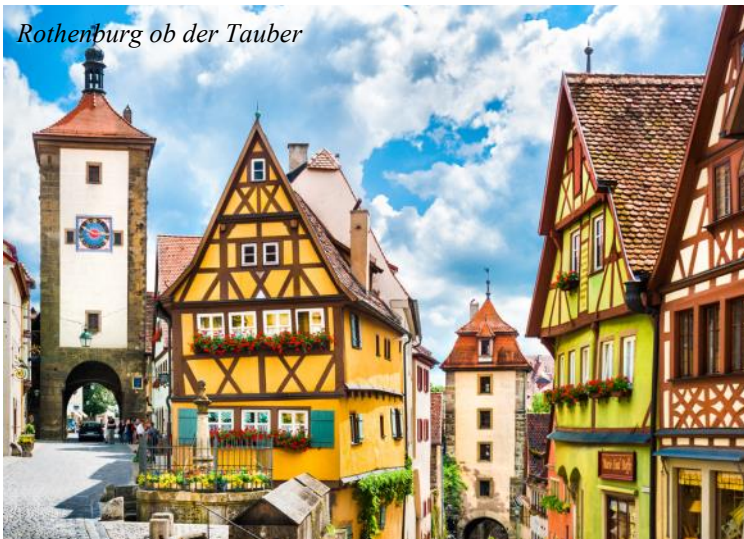
Rothenburg ob der Tauber