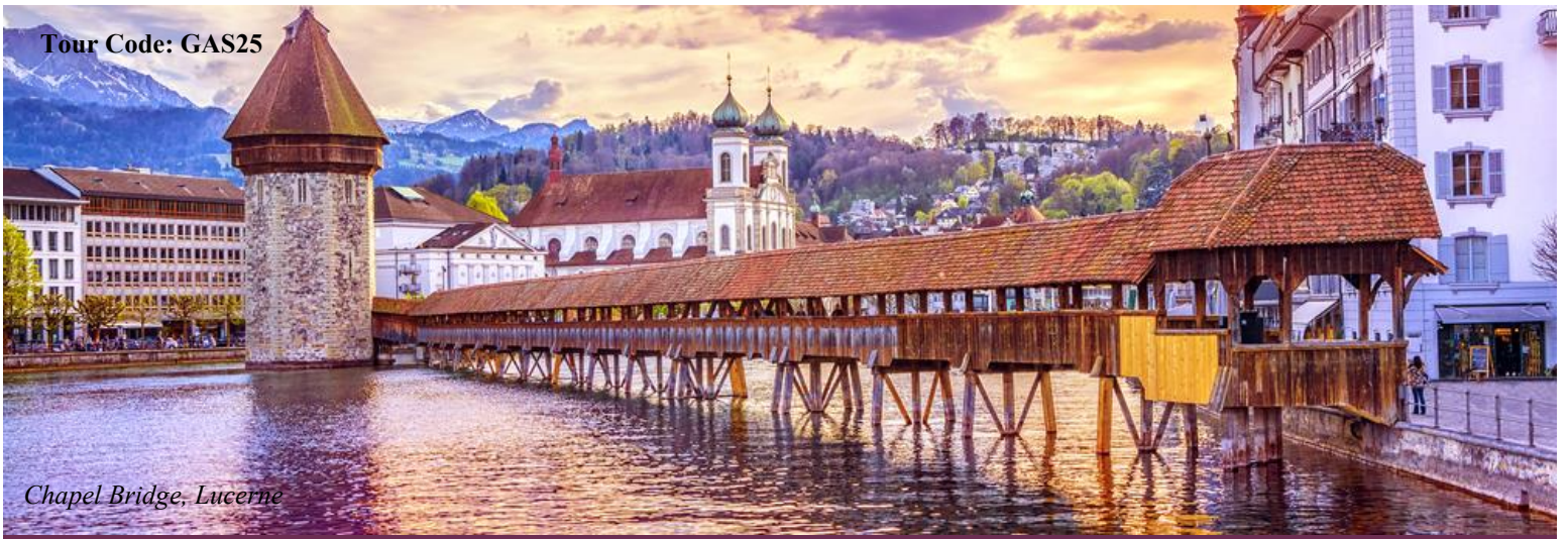
Chapel Bridge, Lucerne