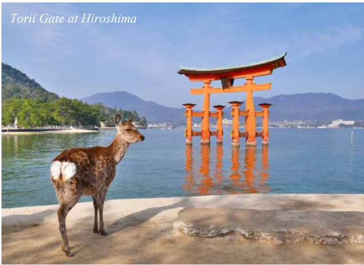
Torii Gate at Hiroshima