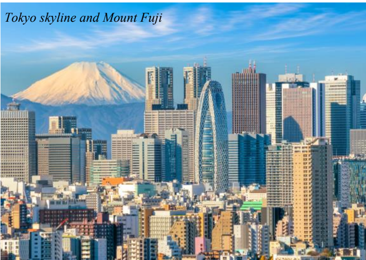
Tokyo skyline and Mount Fuji