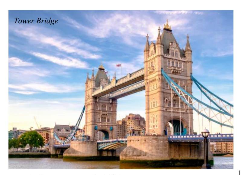
Day 1: Sunday, May 12, 2024 • Departure Our journey begins as we board our international flight bound for London, England. IF