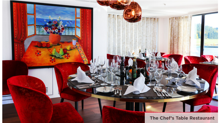
The Chef's Table Restaurant