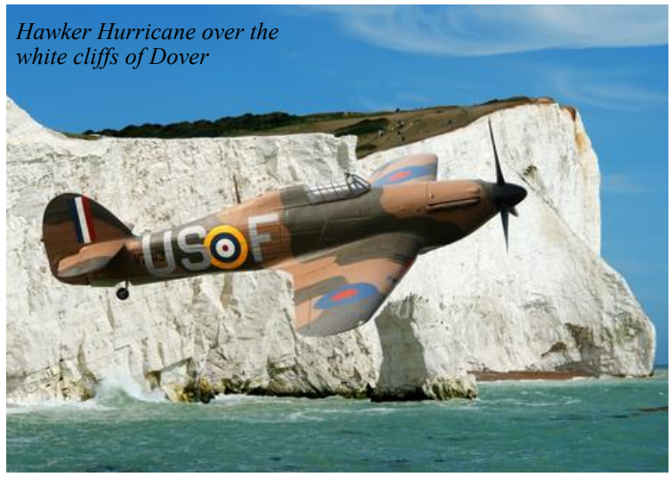
Hawker Hurricane over the white cliffs of Dover

Abbey, and Buckingham Palace (outside visit only, as the King is in residence). We have free time this afternoon to explore on our own. B