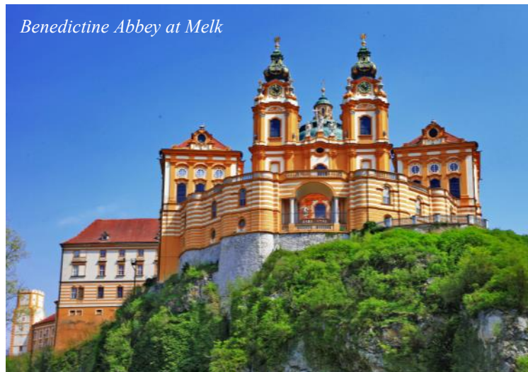
Benedictine Abbey at Melk