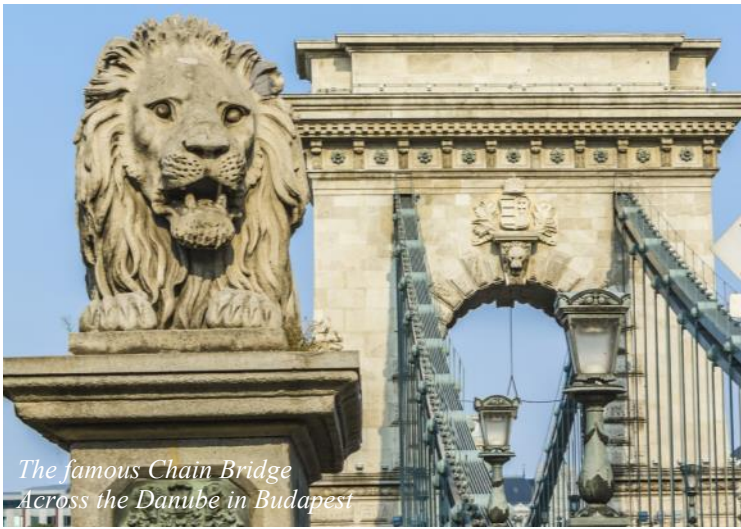
The famous Chain Bridge Across the Danube in Budapest