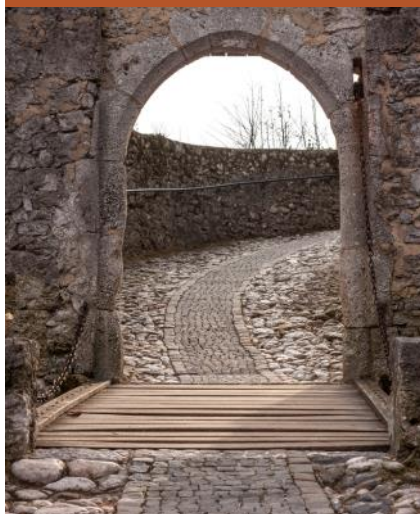
Bled castle gates