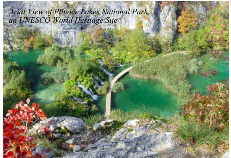
Arial View of Plitvice Lakes National Park, an UNESCO World Heritage Site