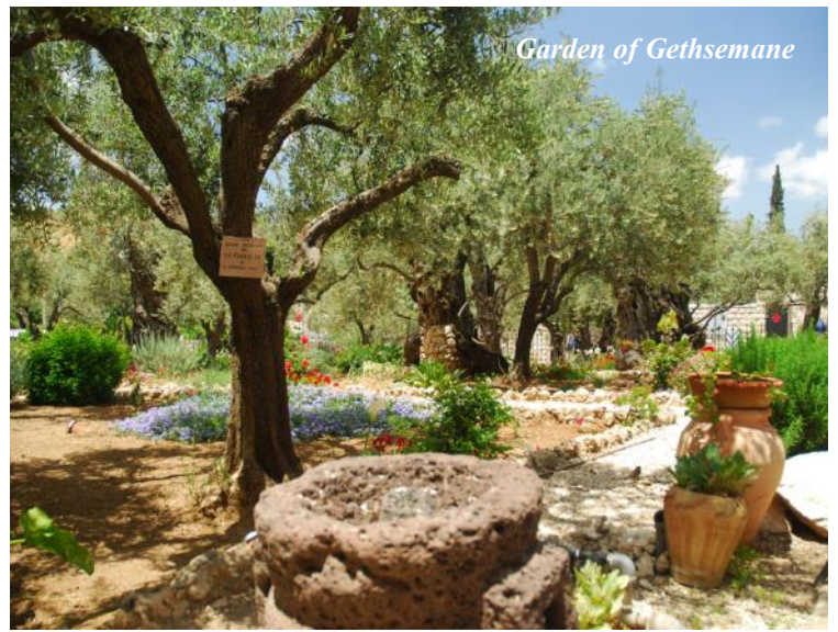
Garden of Gethsemane

Magdala, home of Mary Magdalene. We enter the 2,000-year-old remains of Capernaum (Lk. 4:31-37) and stand in what is left of the synagogue in which our Lord ministered. We also see Peter's house. We visit Tabgha, commemorating the feeding of the 5,000 (Lk. 9); Mensa Christi, where the Lord appeared to the disciples after the resurrection (Jn. 21); and the Church of Peter's Primacy. We end the day with a visit to Mt. Tabor, the site of the transfiguration. We return to the hotel for overnight. B/D