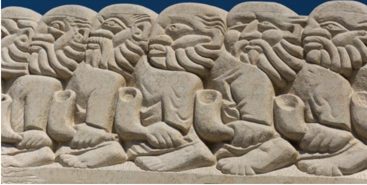
Gate of Faith, Old Jaffa

Day 1: Monday, February 3, 2025 • Depart USA We begin our pilgrimage with a flight to Tel Aviv.