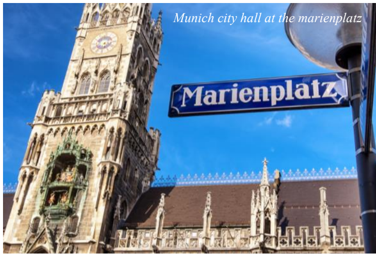
Munich city hall at the marienplatz