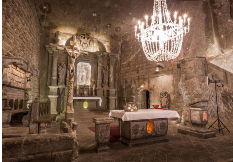
Wieliczka Salt Mine

After breakfast, we drive to the village of Niepokalanow, home to the Basilica of the Blessed Virgin Mary and a Conventual Franciscan Friary founded by St. Maximilian Kolbe, O.F.M. Conv. After viewing a short history of Christianity in Poland we celebrate Mass. We continue to Czestochowa where we visit Jasna Góra Monastery which dates back to the 14 th century. We see the miraculous Black Madonna. Its tradition began when Prince Ladislaus II of Opole invited Pauline monks to Poland. He gave them Jasna Góra hill and a small church under the invocation of Holy Virgin Mary. The prince presented them with the miraculous picture of Our Lady. During the Hussite wars in 1430, the monastery was sacked and robbed and the picture profaned. To this day, one can see the sword-cuts on the cheek of the Madonna. In the year 1717, the picture was crowned with papal diadem and was called the picture of "Black Madonna." The local monks welcome us for a private tour of the monastery