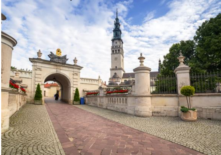
Jasna Gora monastery in Czestochowa