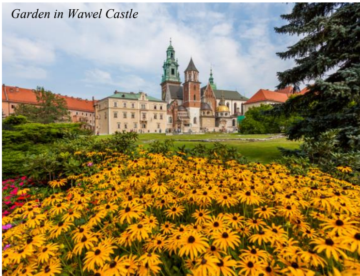
Garden in Wawel Castle

1038, the city became the capital, and the Polish Monarchs took up their residence in its Wawel Royal Castle which we visit. The Old Town historical district in Kraków's heart is actually the medieval city established in 1257, by Prince Boleslav V, the ruler of Poland at the time. Kraków has preserved its original grid of streets arranged around the huge central Grand Square, with the Cathedral Church of St. Waclaw and Bishop Stanislaus. In the middle of the square is the Cloth Hall, built before 1349, and altered in the 16th century. Inside are many shopping stalls, which we will be sure to visit. At the Kraków University, we see the first map of the world depicting North America as a continent. We pass by the shoe factory where young Karol Wojtyła worked during the Nazi occupation of Poland. We walk down Kanonicza Street, passing by some of Kraków's historical buildings. We pause at building 21, "Deanery" where Pope John Paul II resided while in Kraków. Then we proceed to Market Square where we see the Mariacki Church. The rest of the afternoon and evening is free to explore. B